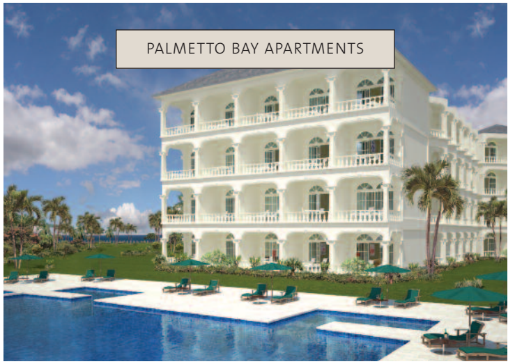
PALMETTO BAY APARTMENTS