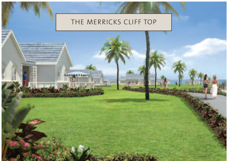
THE MERRICKS CLIFF TOP