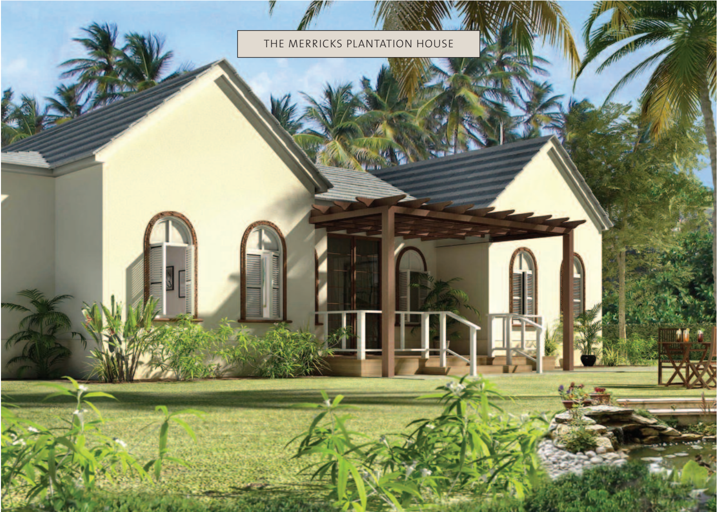
THE MERRICKS PLANTATION HOUSE