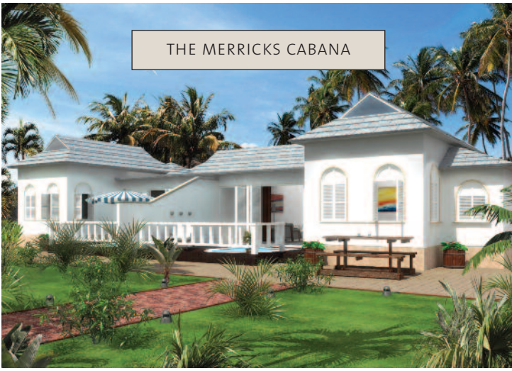
THE MERRICKS CABANA