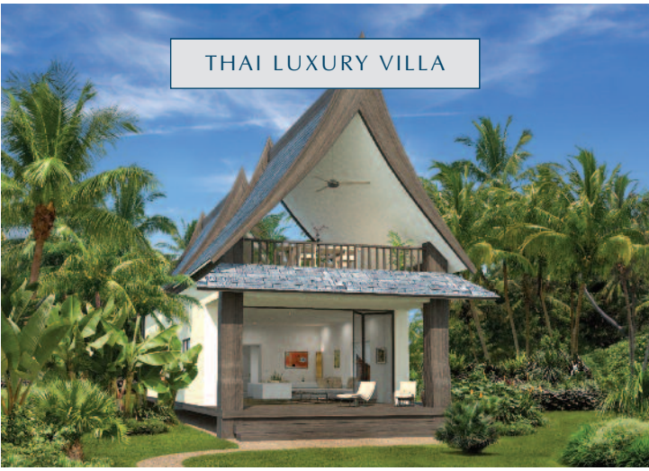
THAI LUXURY VILLA